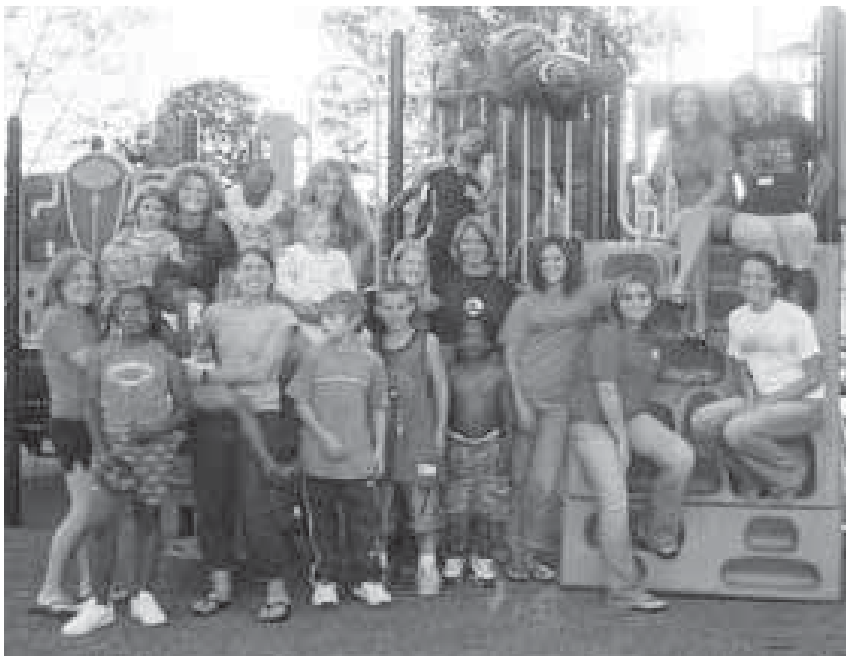
Young Life Campaigner Group from Washington, Illinois