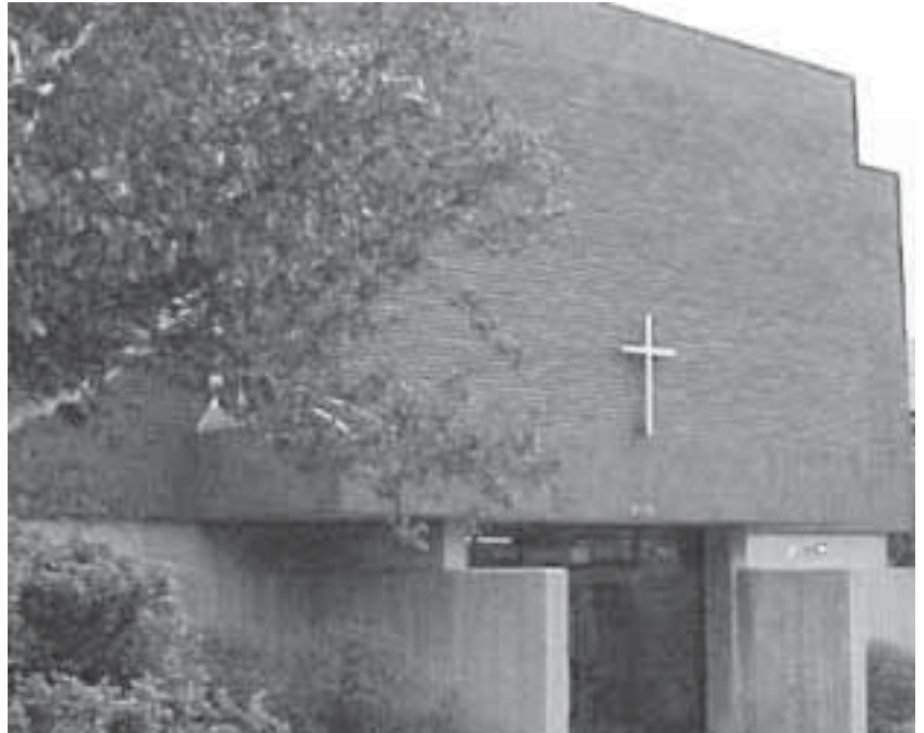
Emma Norton Residence