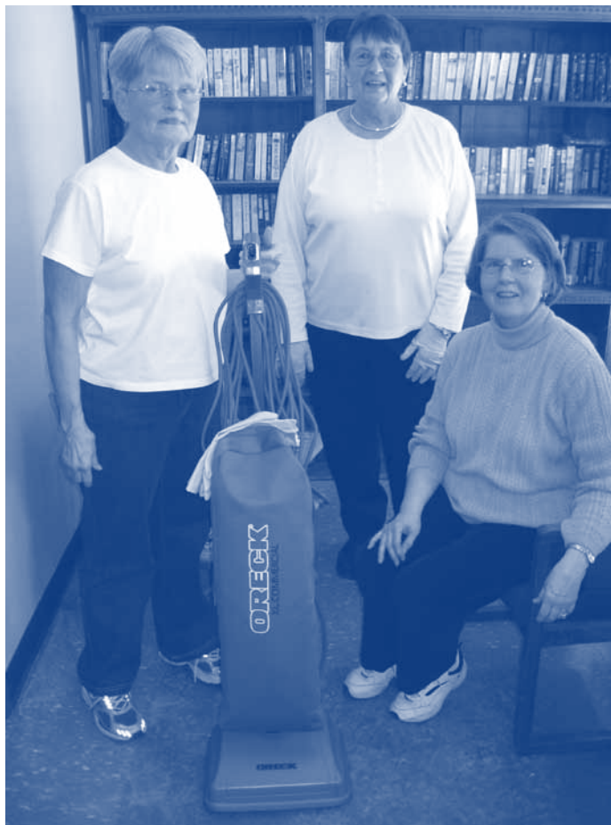
Grace UMC (Pequot Lakes) donated vacuum cleaners.