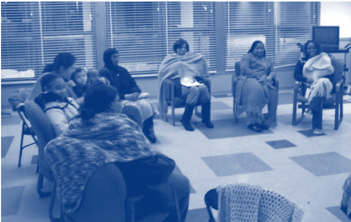
Residents participate in group work.

ENS seeks to create a positive nurturing environment where women can attain some stabilization and then explore and create a future story for their lives and the lives of their family members. Our guiding philosophy recognizes the dignity and innate capability of each of our residents. The staff does not impose particular plans and goals on a resident. Instead, based on a relationship of mutual respect, we work in partnership with each resident to shape an individualized plan that stems from her particular needs and dreams.