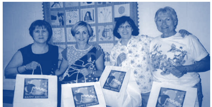
Volunteers stuff birthday gift bags for residents.

Thank you to everyone who helped make this a successful year.