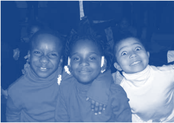
Kids participate in an after school program.