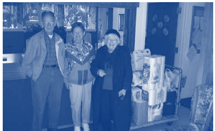
In-kind donations arrive at Emma Norton Residence.