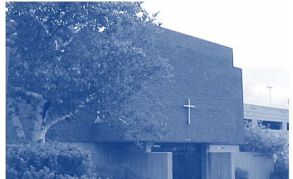
The Emma Norton Residence facility in downtown St. Paul is a 45-bed residence, offering long-term support and services for homeless women in transition, whose goals are to become independent and self-sufficient.

Advent UMC (Eagan) Centennial UMC (Roseville) Christ UMC (Maplewood) Fairmount Avenue UMC (St. Paul) First UMC (Correll) First UMC (St. Cloud) Grey Eagle UMC (Grey Eagle) Hillcrest UMC (Bloomington) Holy Trinity UMC (Prior Lake) Immanuel UMC (Corcoran) Korean UMC (New Brighton) Lydia Zion UMC (Jordan) McGregor UMC (McGregor) New Avon UMC (Redwood Falls) Oakland Avenue UMC (Minneapolis)